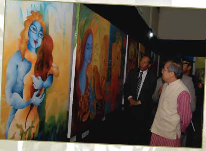
Meghalaya Governor Shri Ranjit Shekhar Mooshahary, inspecting the painting exhibited during the 7th National Art Festival held on April 27, 2010 at All Saints'