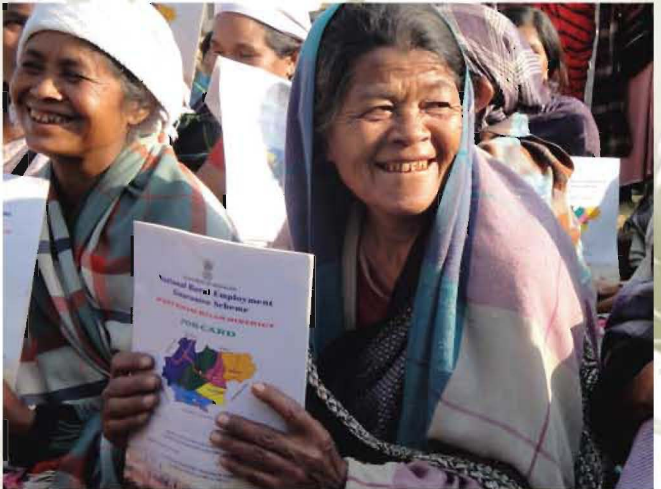
NREGS Card holder.

Small scale weaving unit in West Khasi Hills District.