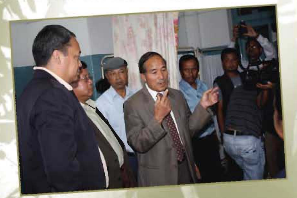
Meghalaya Health Minister, Shri Rowell Lyngdoh inspecting Civil Hospital, Shillong on May 6, 2010