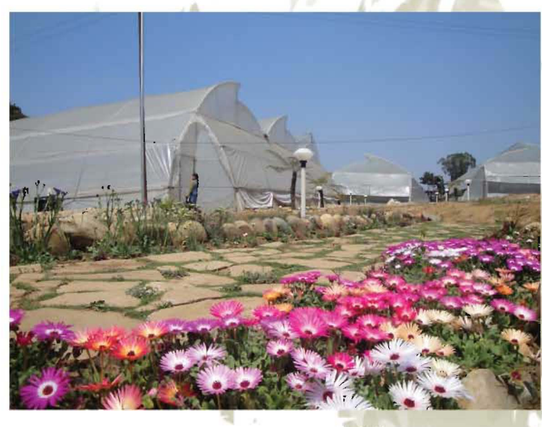
Poly houses at the Horticulture Hub in Jaintia Hills District.

organised by the Directorate of Information and Public Relations, Meghalaya