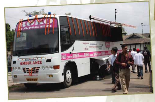
The Cancer Detection Mobile Bus in Shillong