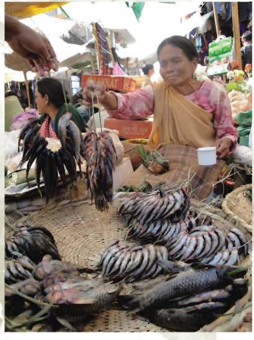
A local fish vendor at Nongstoin market, West Khasi Hills District.