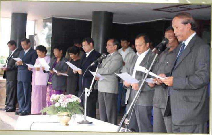
Meghalaya Deputy CM, Shri B. M Lanong administering the Oath on the occassion of World Anti-Terrorism Day at Rilang Building in Shillong on May 21, 2010