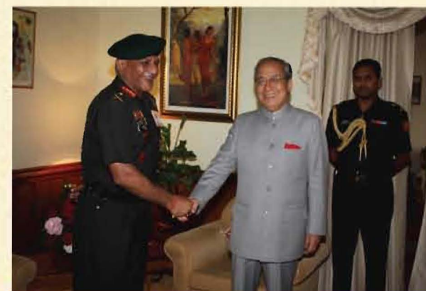
Shri. R. S. Mooshahary, Governor of Meghalaya with General V. K. Singh, Chief of Army Staff at Raj Bhavan, Shillong on 19.07.10