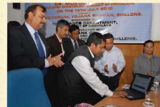
Meghalaya CM, Dr Mukul Sangma launching the Online System of Tax Receipt via Cyber Treasury at the Yojana Bhavan Auditorium, Shillong on 14.7.10