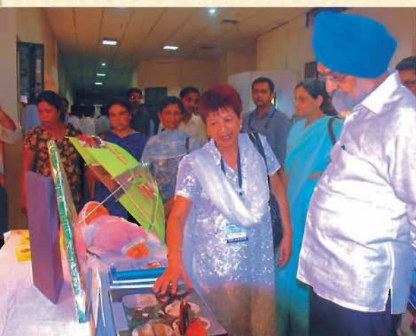
Dr. Montek Singh Ahluwalia, Deputy Chairman Planning Commission at the Display Material (Meghalaya) Pre Retreat Poster Exhibition on Innovative Approaches at New Delhi.

The Retreat sought to evolve a Framework for a multisectoral National Plan of Action to prevent and reduce undernutrition – especially maternal and child undernutrition in India, in a time bound manner, with clearly articulated commitments of different stakeholders.