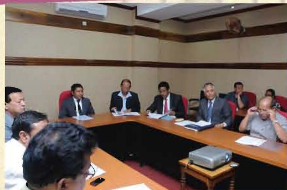
Meghalaya Chief Minister, Dr. Mukul Sangma attending the Border Area meeting at the Committee Room, Yojana Bhavan, Shillong on July 15, 2010