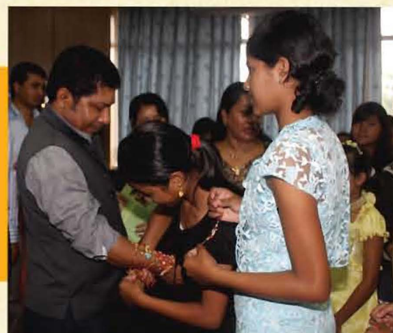
Children from S O S village, Umiam tying Rakhi wristbands to the Meghalaya Chief Minister, Dr Mukul Sangma in his office chamber on 24.8.2010