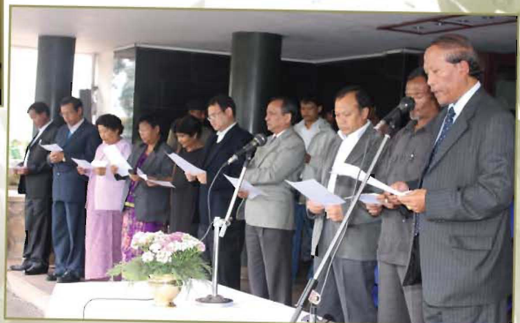
Meghalaya Deputy CM, Shri B. M Lanong administering the Oath on the occasion of World Anti-Terrorism Day at Rilang Building in Shillong on May 21, 2010