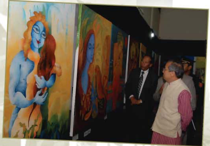
Meghalaya Governor Shri Ranjit Shekhar Mooshahary, inspecting the painting exhibited during the 7th National Art Festival held on April 27, 2010 at All Saints'