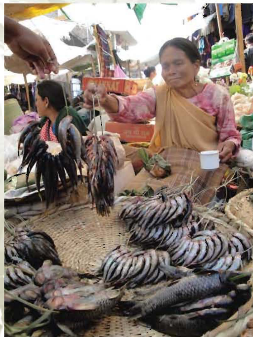
A local fish vendor at Nongstoin market, West Khasi Hills District.