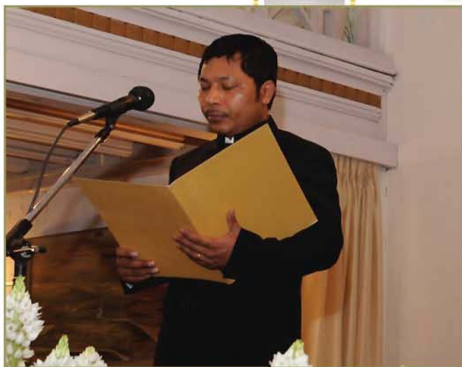
Dr. Mukul Sangma being sworn in as Meghalaya Chief Minister on 20.4.2010