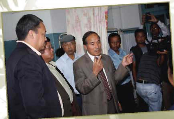
Meghalaya Health Minister, Shri Rowell Lyngdoh inspecting Civil Hospital, Shillong on May 6, 2010