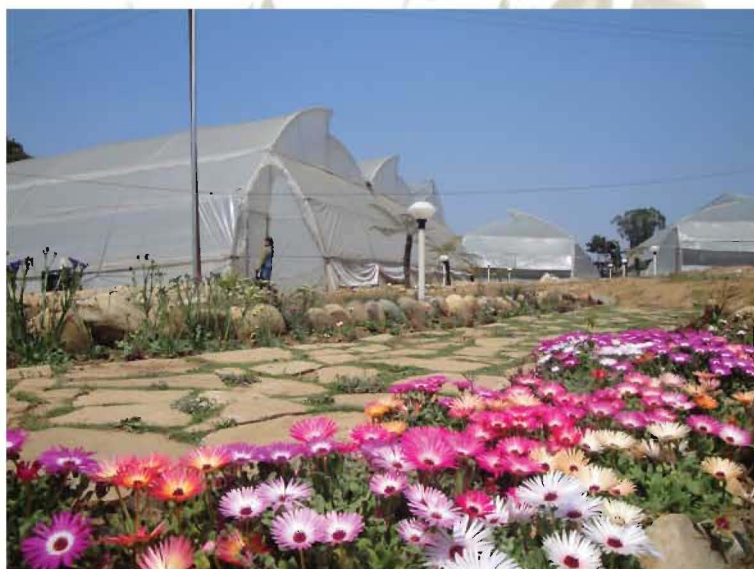
Poly houses at the Horticulture Hub in Jaintia Hills District.