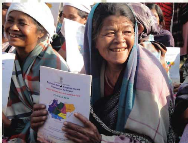
NREGS Card holder.