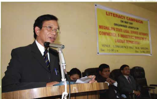
Litracy Campaign held on May 1, 2010 at DCIC, Shillong