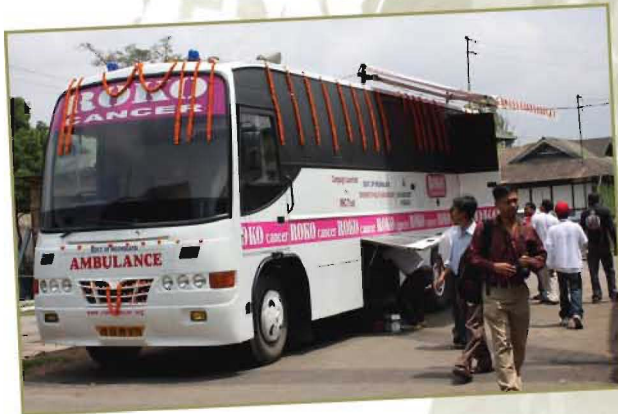
The Cancer Detection Mobile Bus in Shillong