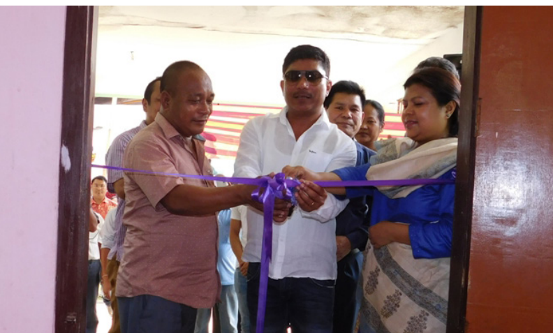
Meghalaya Sericulture and Weaving Minister Zenith Sangma inaugurating the Common Facility Centre cum Handloom Production Unit at Zikzak C and R D Block on April 15, 2016.