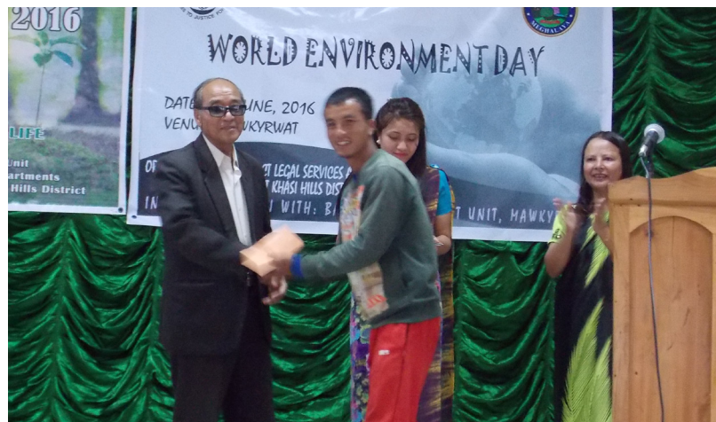
Shri. Rowell Lyngdoh, Deputy Chief Minister of Meghalaya giving away the prize to the winner of the Environment Run Competition held on the occasion of World Environment Day on June 10, 2016.