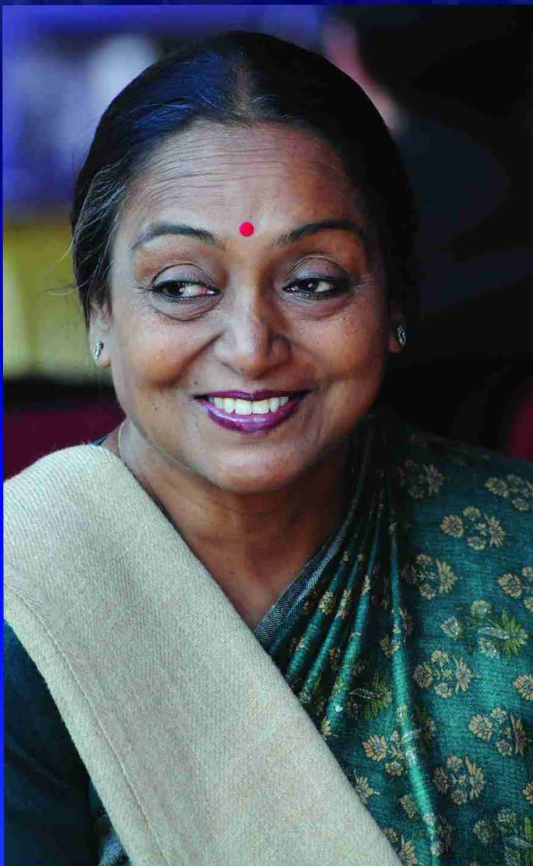
Speaker of the Lok Sabha, Mrs. Meira Kumar attending the 12th NERCPA Conference on January 29, 2010.