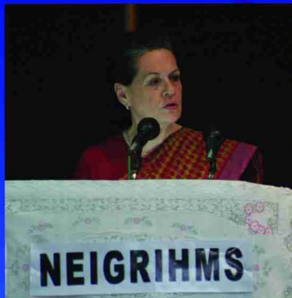
UPA Chairperson, Mrs. Sonia Gandhi's visit to the State capital on March 5, 2010