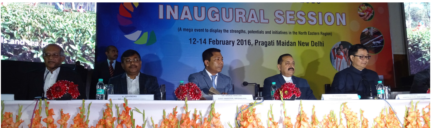
Meghalaya Chief Minister Dr. Mukul Sangma attending 'Destination North East-2016', a festival organized by the Union Ministry for Development of North Eastern Region (DoNER) and Union Ministry of Culture for showcasing the inherent economic, social and cultural strength of the North East region at the national level, at in New Delhi on February 12, 2016.