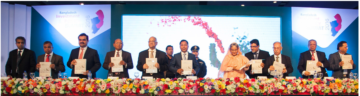
Meghalaya Chief Minister Dr Mukul Sangma attending the Bangladesh Investment & Policy Summit 2016 at Bangladesh as a Special Guest on January 24, 2016.