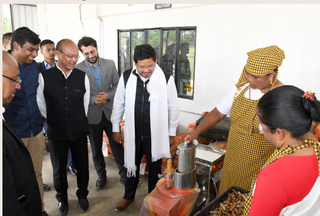
Meghalaya Chief Minister, Conrad K. Sangma interacting with farmers during the Lakadong Festival held at Laskein village in West Jaintia Hills District on 10.05.2022