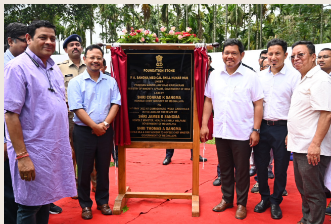
Meghalaya Chief Minister, Conrad K. Sangma laying the foundation stone of the P.A. Sangma Medical Skill Hunar Hub at 14.05.2022