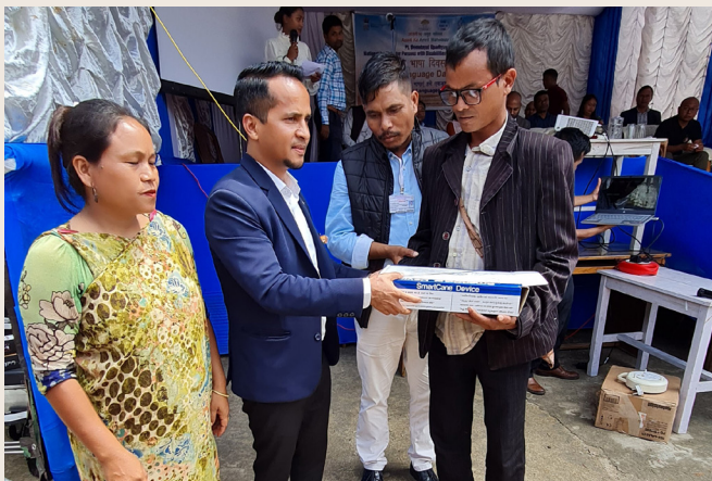
Minister of Social Welfare Kyrmen Shylla distributing free Aids and Appliances to PWDs in Khliehriat, East Jaintia hills District on 17.09.22