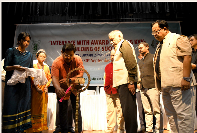
Meghalaya Chief Minister, Conrad K. Sangma, lighting the lamp while inaugurating the national seminar on 'Interface with Award Winning KVKs Building of Success' at College of Post Graduate Studies in Agricultural Sciences, CAU, Umiam on 29.10.22.