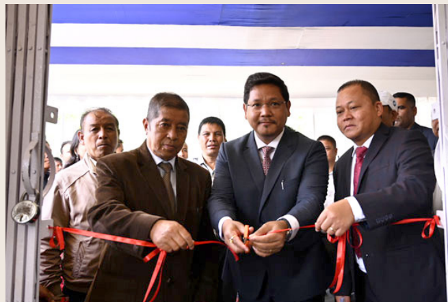
Meghalaya Chief Minister, Conrad K. Sangma inaugurating Umlingka Milk Collection Centre on 27.06.2022