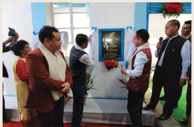
PHE Minister R. I. Tongkhar inaugurating the renovated Jowai Water Supply Scheme and laying the foundation stone for Mihmyntdu Water Supply Scheme and Khliehtyrshi Combine Water Supply Scheme at the Urkhla, Jowai on 27.05.22